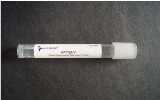
APTIMA Unisex Genital Swab