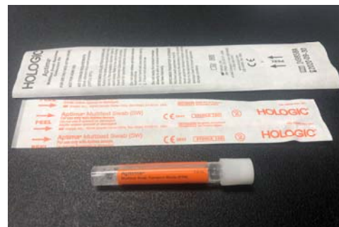
APTIMA Multitest Swab-Orange