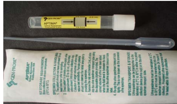
Unisex Urine Collection